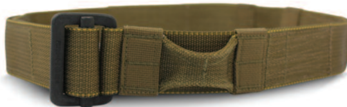
RIGGER BELT, QUICK FIT TYR-RBB015