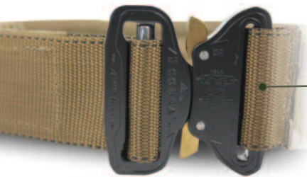
2" COBRA® BUCKLE