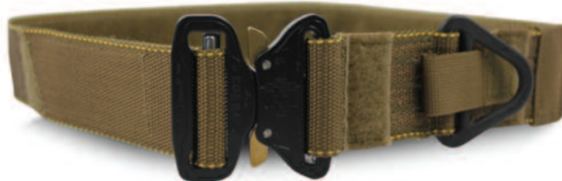
RIGGER BELT TYR-RBB009