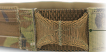
SOFT RIGGER POINT

Our complete line of Rigger & Tactical Base Belt's are built to meet your mission requirements.