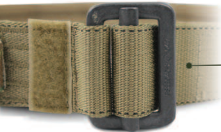
2" QUICK-FIT ADAPTER