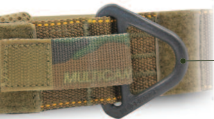
FORGED STEEL EXTRACTION RING