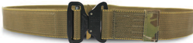
TACTICAL BASE BELT-D TYR-DBB002

COMPATIBILITY: XFrame™, Low Profile, Standard Gunfighter™ Belt-B Models or Standard Uniform/Tactical Pants AVAILABLE SIZES: SMALL - 3XLARGE