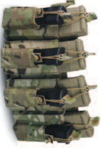
TYR Tactical® PICO-DS Assaulters Chest Rack TYR-DSCH005