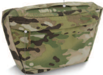
Magnetic GP Pouch Closure

The TYR Tactical® Ballistic Lower Abdomen Platform -GP Pouch (TYR-LW109-GP1) attaches to the front plate pocket via hook and loop adapter platform. It also provides additional load carriage locations for tourniquets, breaching rounds, flashbangs and firing systems.