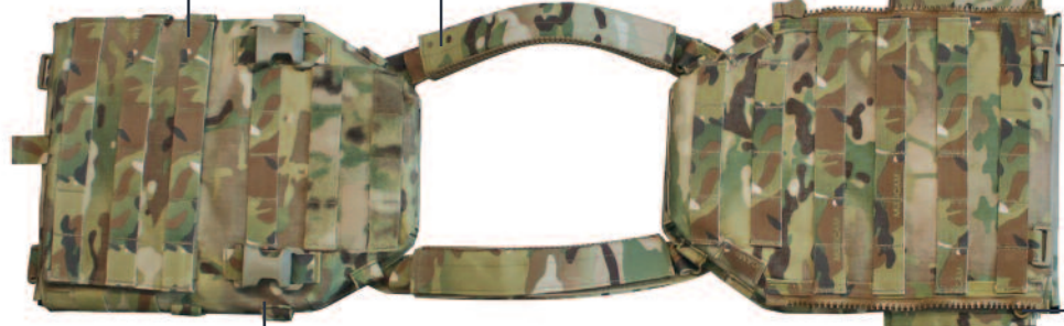
TYR Tactical® PICO-DS Assaulters Plate Carrier TYR-PICO-DS