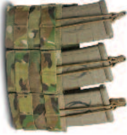
TYR Tactical® Kangaroo Front Flap - Fixed Triple Open Top Happy Mag® M4, MOLLE TYR-LW0203-556H