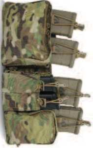
TYR Tactical® PICO-DS Combat Adjustable Chest Rack TYR-DSCHR001