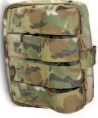
TYR Tactical® PICO-DS Medical Chest Rack TYR-LWM0204-V2