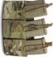
TYR Tactical® Kangaroo Front Flap - Fixed Triple Open Top M4, No MOLLE TYR-LW0203-556